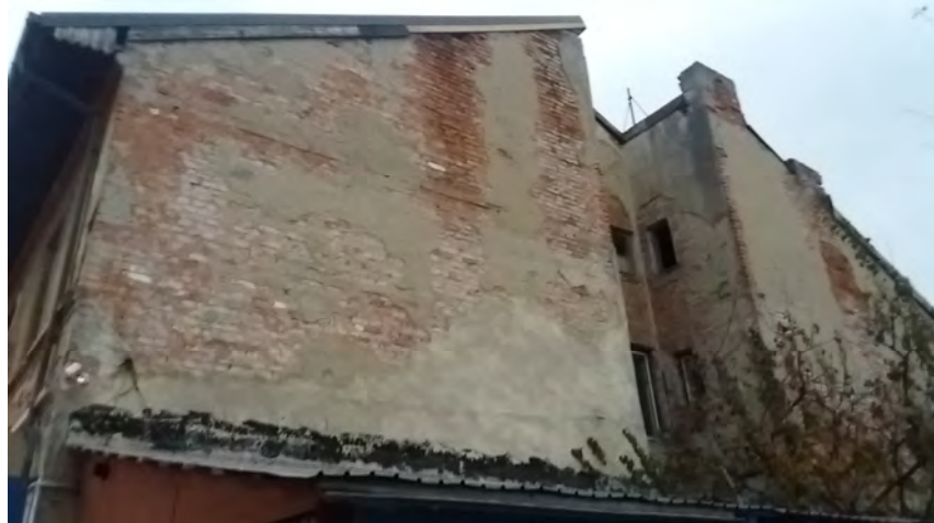
Mircea Vulcanescu main street - Pre-1940 building with decayed gable wall