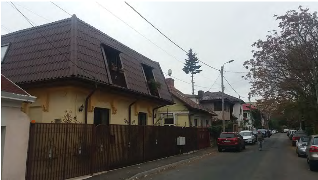
Range of pre-1940 houses, with recent rehabilitation including a second story for living