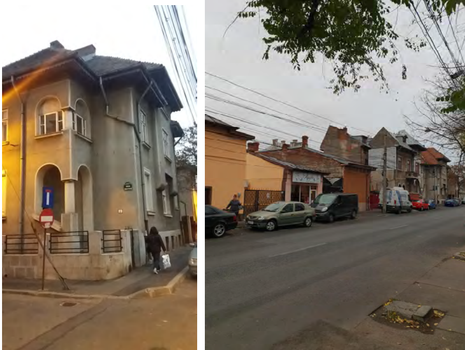
Pre-1940 building in good condition at corner of Mircea Vulcanescu main street with Stefan Furtuna Entrance and old buildings along of main street with different threats for citizens in case of earthquake