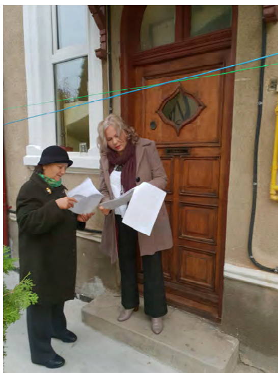
Discussion between two ladies in St. Furtuna Entrance based on ECBR leaflet about earthquake preparedness in their house