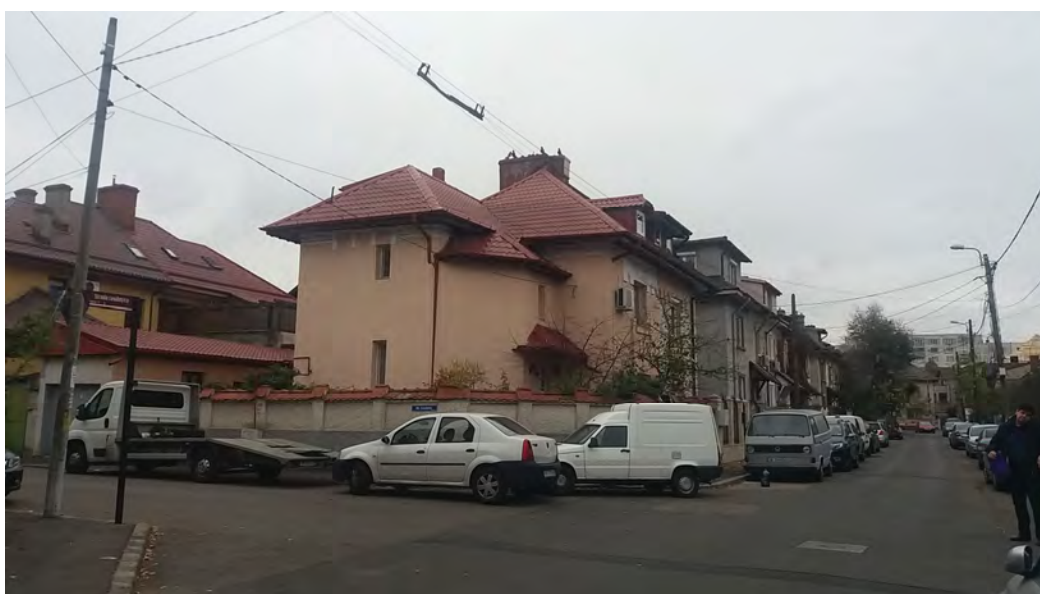
Range of pre-1940 houses, with recent rehabilitation