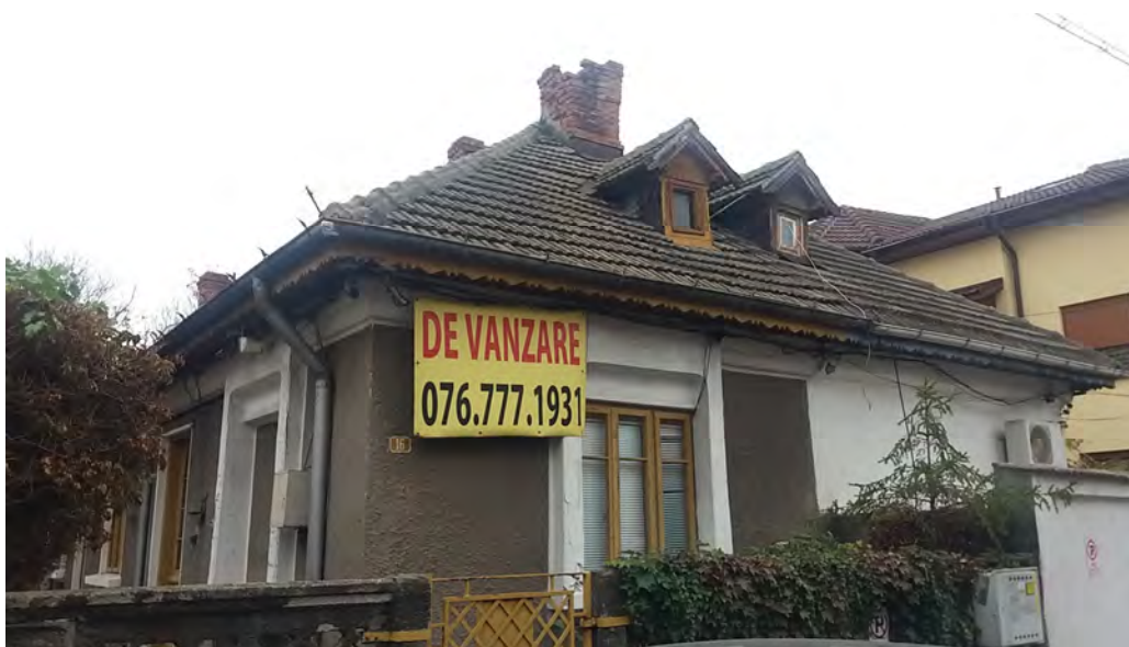
House of pre-1940 generation, duplex type, with damaged chimneys