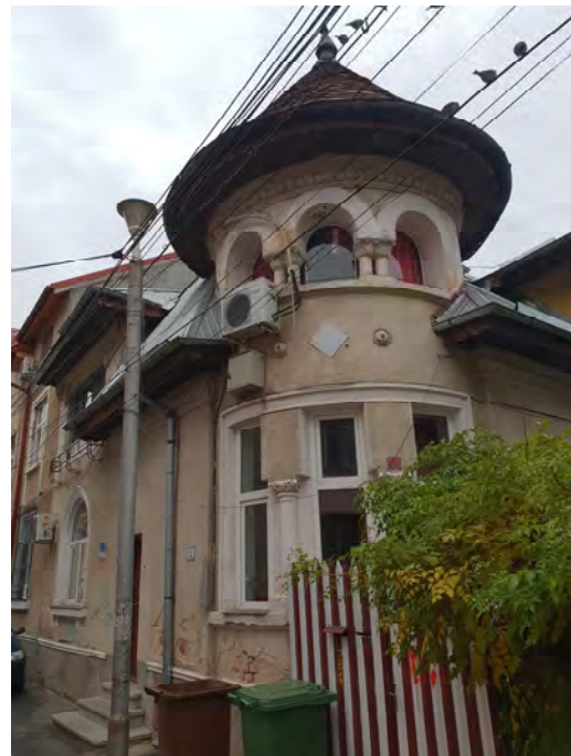
Two story manors of Neo-Romanian style on Stefan Furtuna Entrance